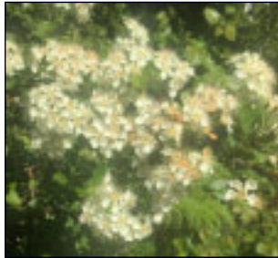
8. May Blossom