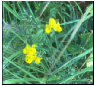
6. Yellow vetch