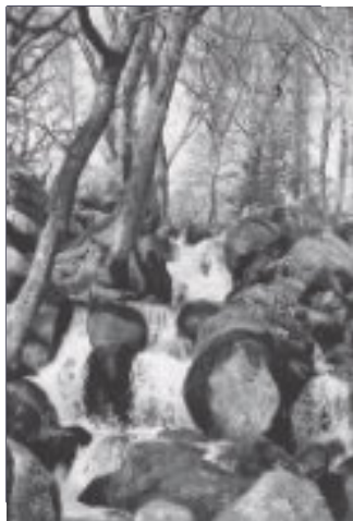
Becky Falls, 1971. Practika Nova, printed in a Meopta Opemus II.

Determining camera settings was a nightmare, very hit-and-miss. We started with a cardboard dial: set the conditions: sun bright, cloudy, dull, plus the film speed in ASA, BS or Scheiner, and read off the result. It worked, sort of, but was useless shooting into the sun and as for shutter times over a couple of seconds, forget it. Then there was Ansel Adams and his zone system. Magic by numbers, at last you could do exposure .