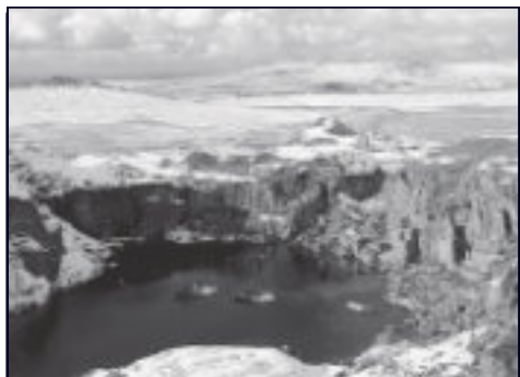
The fatal picture, Foggintor, 1989.

We put a talk together. With pictures. It was a major mistake: one that was shown to them—me confidently explaining "and of course if you do this, well, here's an example of a print made with a single exposure, no darkroom fakery . . .": just they were never told that's the only negative I have ever, ever produced that does it. I am no longer a member of that club, believing the business of a photographer is to somehow convey to the viewer why the image exists, rather than please some judge.