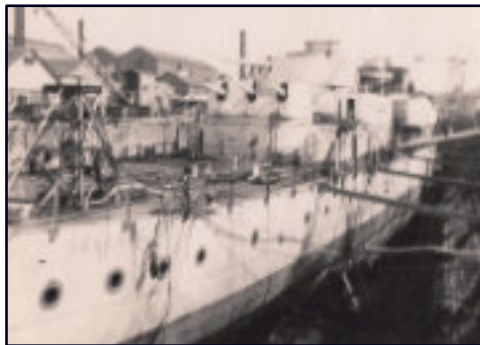
HMS Belfast, Plymouth Navy Days, 1958. Kodak Duaflex II, shop processed by Homan Ham

I have often thought about what makes me take photographs. The short answer is, they are a signpost to memories, to where and what, much more than when. The first camera I used was was very much a ‘you press the button we do the rest’.